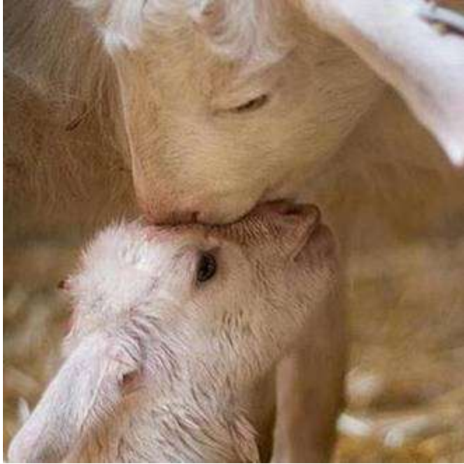
Amazing Photos - A Love expressed