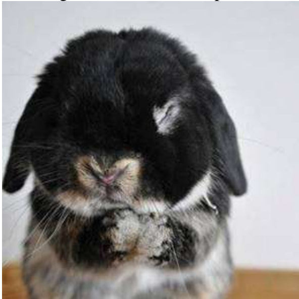
Amazing Photos – A Praying Rabbit!